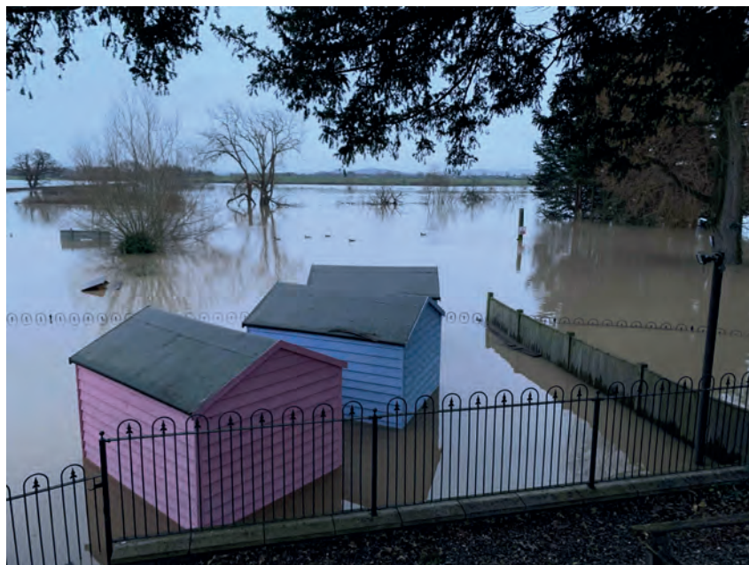
Photograph, Roy Thomas