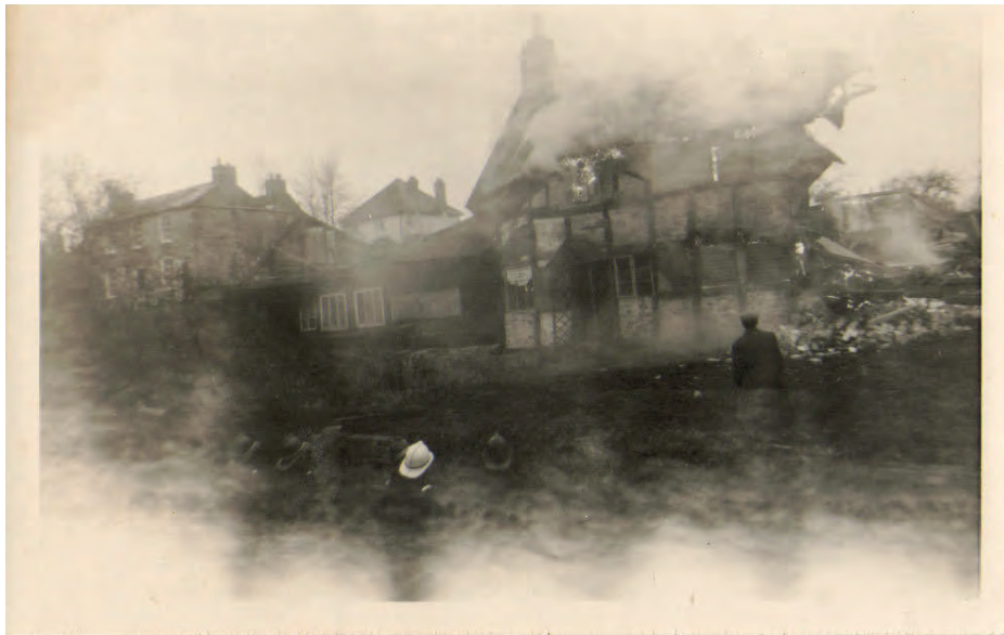
Fire strikes one of the village's Tudor properties, 20th century.