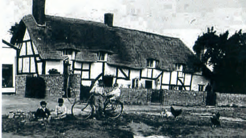
Opposite the shop, date unknown.