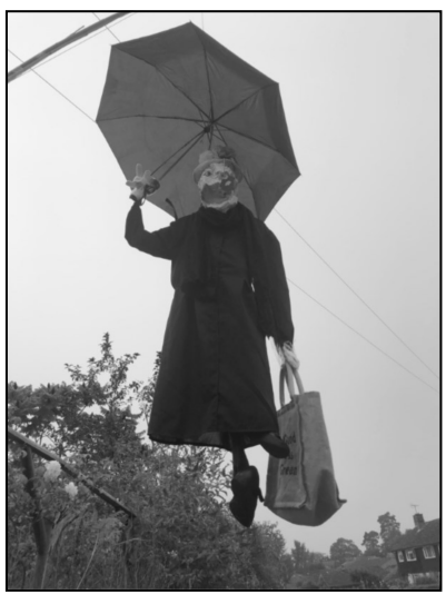
From scarecrows to flowers to vegetable transport, village residents got into the competitive spirit!