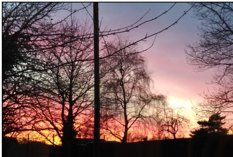
Above: Twyning sunrise